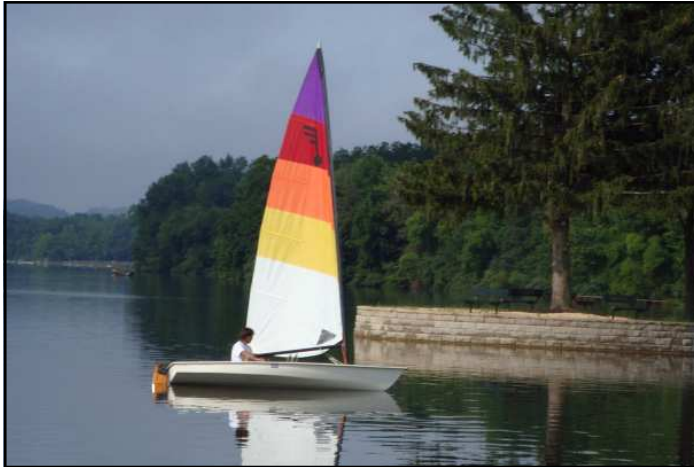
Sailboat on Pinchot Lake.

We often think of park activities requiring great physical exertion: ice boating, trail running, or warbler watching. For those of you tired of being cold, not interested in being rained upon, or just needing a break from all that, Gifford Pinchot State Park has the fair weather sport for you...sailboat watching! Yup, as long as you can see the boats, hear the cheering, or feel the warm sun and gentle breeze, this is the sport for you.