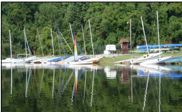
Sailboats moored at Boat Mooring #2.