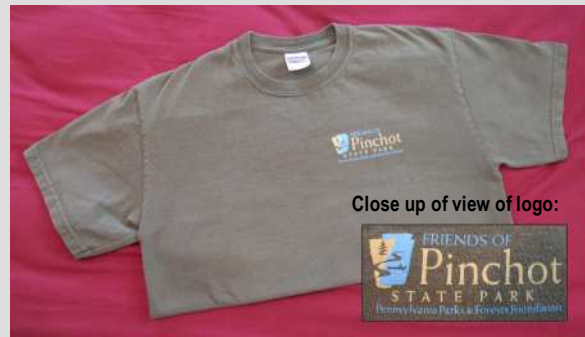
Friends of Pinchot State Park Logo Military Green

T-Shirts are 100% Cotton Sizes Available: Adult - S, M, L, XL, 2X, 3X Friends of Pinchot State Park Members, $12.00* Non-Members, $15.00*