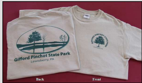
Gifford Pinchot State Park w/Pine Tree Image Sand w/Forest Green

Available at the Open House on Saturday, June 25, 2011