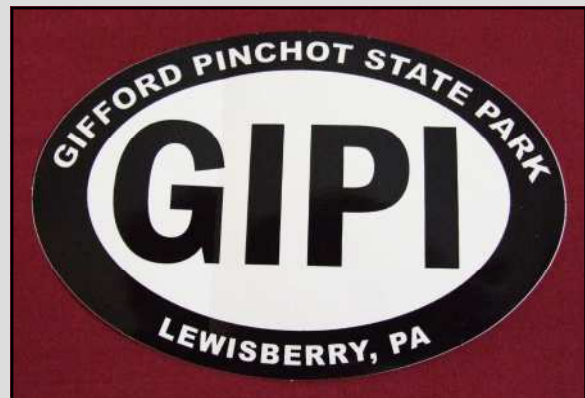
4x6 Oval Removable Bumper Sticker $2.00 each

T-Shirts are 100% Cotton Sizes Available: Adult - S, M, L, XL, 2X, 3X Friends of Pinchot State Park Members, $12.00* Non-Members, $15.00*